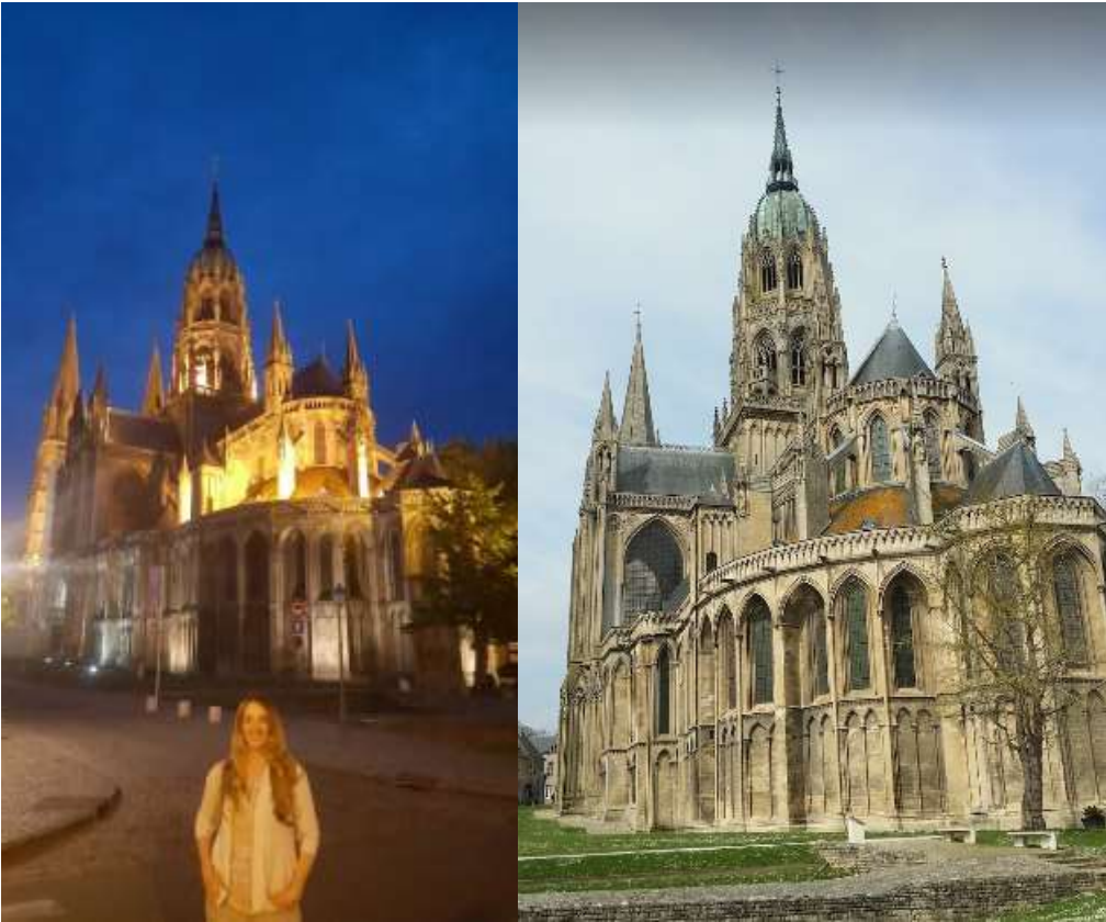
Bayeux Cathedral Rue du Bienvenu, 14400 Bayeux, France