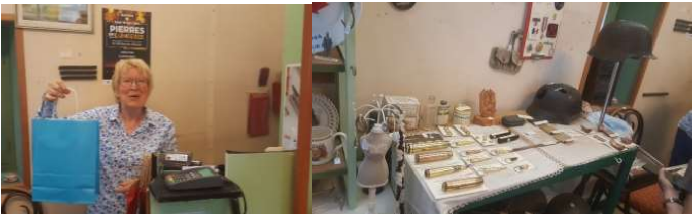
Brocante de Jolies Choses 7 Bis Rue Larcher, 14400 Bayeux, France